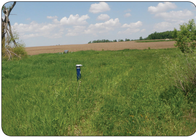
Figure 2. Buffer strip between a well and an agricultural field.